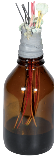
Test setup: Verification of capillary effect with AdBlue in a glass bottle • Yellow: Standard cables • Black/red: Anti-capillary cables